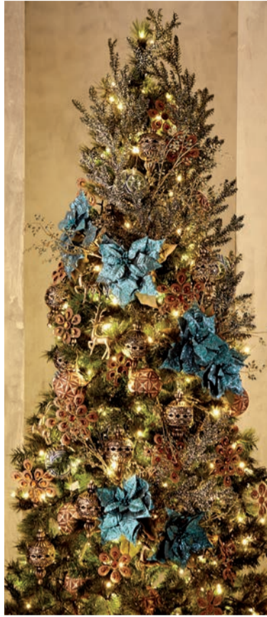
Once again it is that time of year to enjoy and celebrate with family, relatives and close friends. So take some time to make home a little more special for a memorable time against a backdrop put together by virtue of time, effort and lots of love.

Complete with burnished silver and gold ornaments, miniature trees and pine cones, charming crystal candle holders and matching furnishings. Let interiors glisten and glow with charm and charisma that leave guests oohing and aahing about the captivating setting.