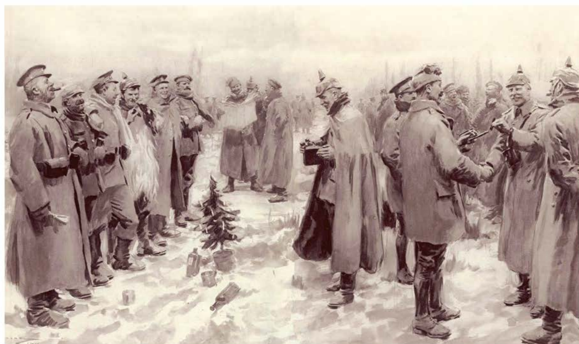
An artist's impression from The Illustrated London News of 9 January: 1915 British and German soldiers arm-in-arm exchanging headgear a Christmas truce between opposing trenches.

From one battle to another, Christmas was a bleak time for