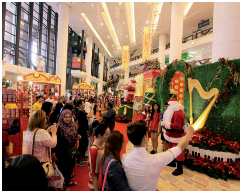
performance alongside 50 children and adults from the YMCA Pusat MajuDiri "Y" For The Deaf. A