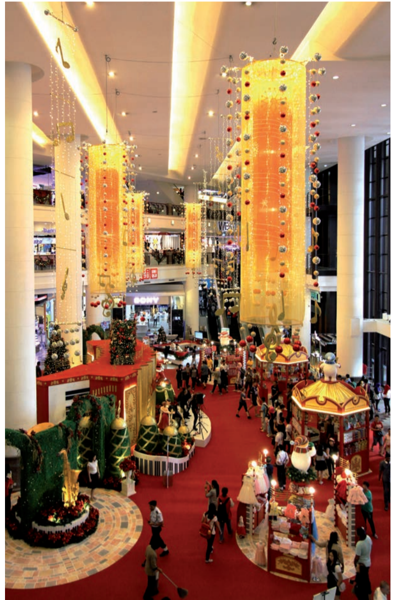
world-renowned band of deaf drummers – DeafBeat Malaysia will also perform.