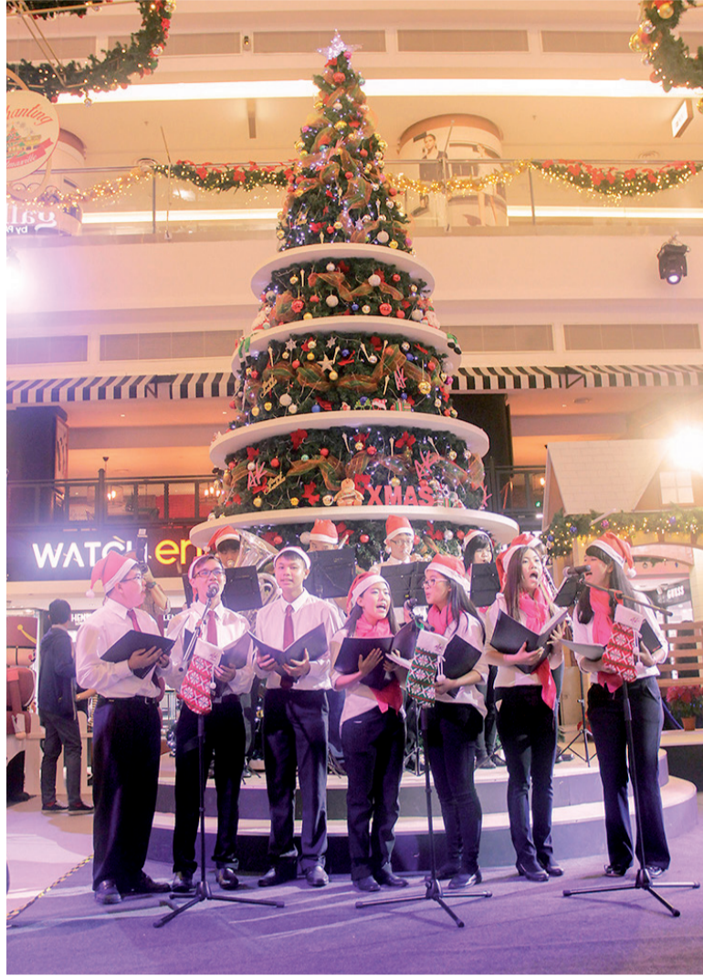
Great Britain Festival at AK". "Christmas is also the best time to bring families and loved ones