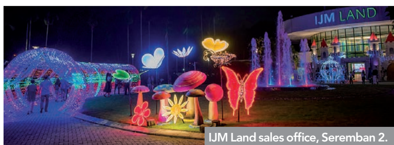
IJM Land sales office, Seremban 2.

within Seremban 2’s safe living environment and strategic location.”