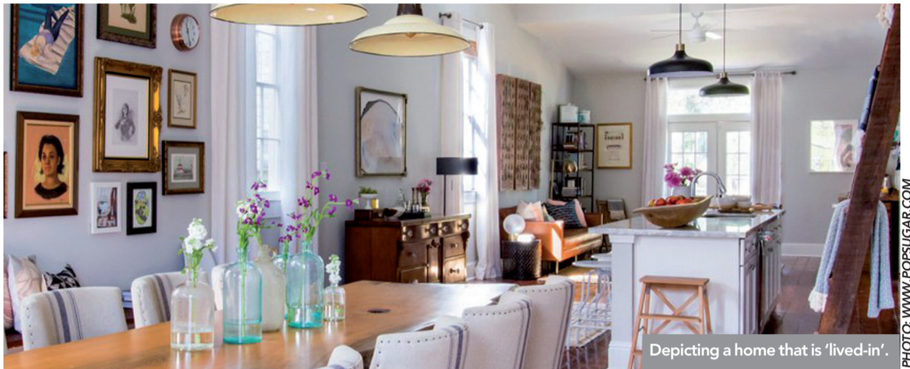
Depicting a home that is 'lived-in'.

Just one ray of light, that is. Most Malaysian homes have the typical fluorescent tube lamps in their home. What's important is having layered lighting options and