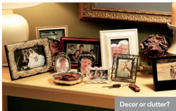
Decor or clutter?