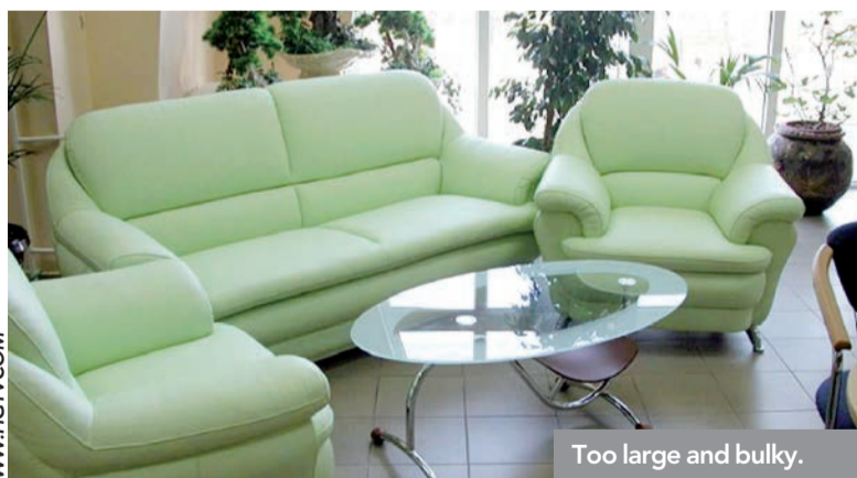
Too large and bulky.

► Email your feedback and queries to: propertyqs@thesundaily.com